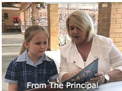
From The Principal

Newsletter | Term 4 Week 6 | 21 November 2019