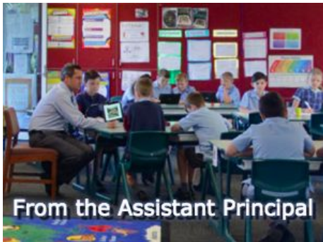
From the Assistant Principal

This Friday, St Finbar's will be hosting a Lots of Socks Day to celebrate World Down Syndrome Day.