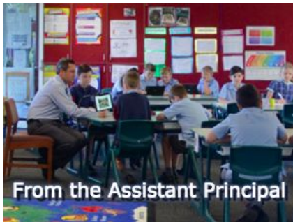
From the Assistant Principal

We started this term by opening our long awaited Sensory Garden. This new play space offers students a new multi sensory playground to access during break times. The space is also used during the school day, to provide students with a learning environment that gives them access to a variety of aromas, textures, colours, noises, physical activities and shapes.