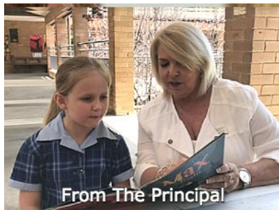
From The Principal

Newsletter | Term 4 Week 8 | 5 December 2019