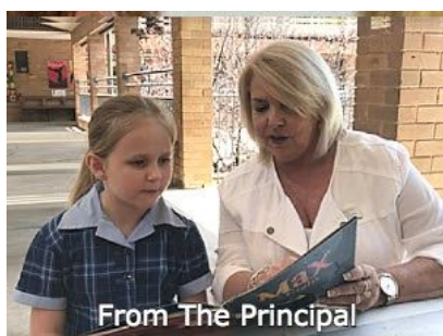
From The Principal

Newsletter | Term 1 Week 2 | 6 February 2020