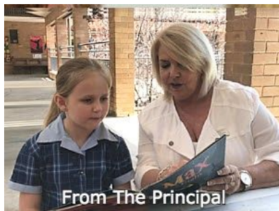
From The Principal

Newsletter | Term 4 Week 8 | 3 December 2020